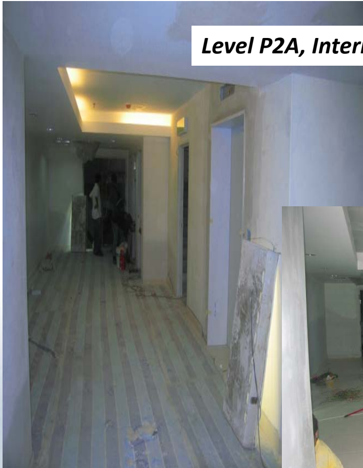
Level P2A, Internal view